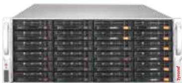
24 Bay 4U Rackmount Server

Tyrone recorder storage servers come with superior storage capacity optimized for video streaming.