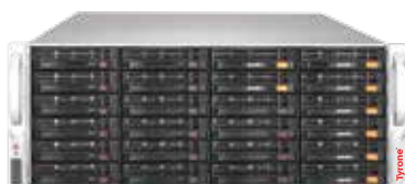
36 Bay 4U Rackmount Server

Ideal for media storage, remote access, archiving data and several other surveillance applications