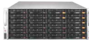
60 Bay 4U Rackmount Server

Consistent high performance optimized for artificial intelligent systems' and read-intensive surveillance applications.